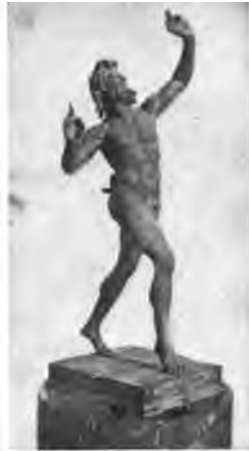
Fig. 53. Dancing Satyr.

Pan's companions, the Satyrs, bear a close resemblance to him. They, too, are wild spirits of the woods and hills, half timid, playful animals, and half human. They have short, flat